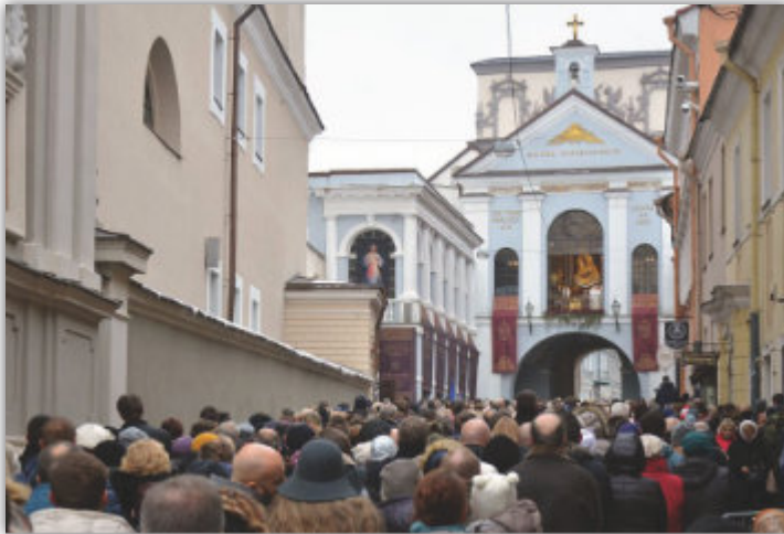
The painting of the Merciful Jesus displayed at the Gate of Down (Vilnius, Lithuania), during the feast of the Divine Mercy. Present view.

“At the Gate of Down, [ in Vilnius] during these three days, the closing of the Jubilee of the Redemption of the world was being celebrated, marking the nineteen hundred years that have passed since the Passion of our Savior. I see now that the work of Redemption is bound up with the work of mercy requested by the Lord...”