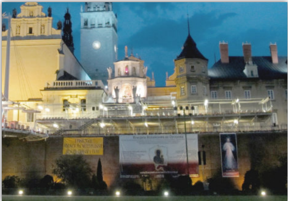
The painting of the Merciful Jesus on the Jasna Góra Walls