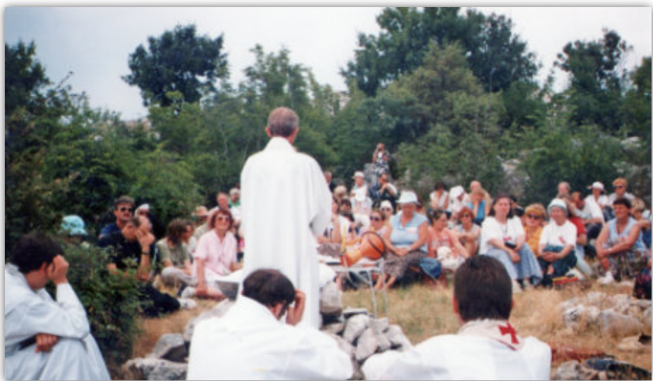
Retreats during the trip to Medjugorie