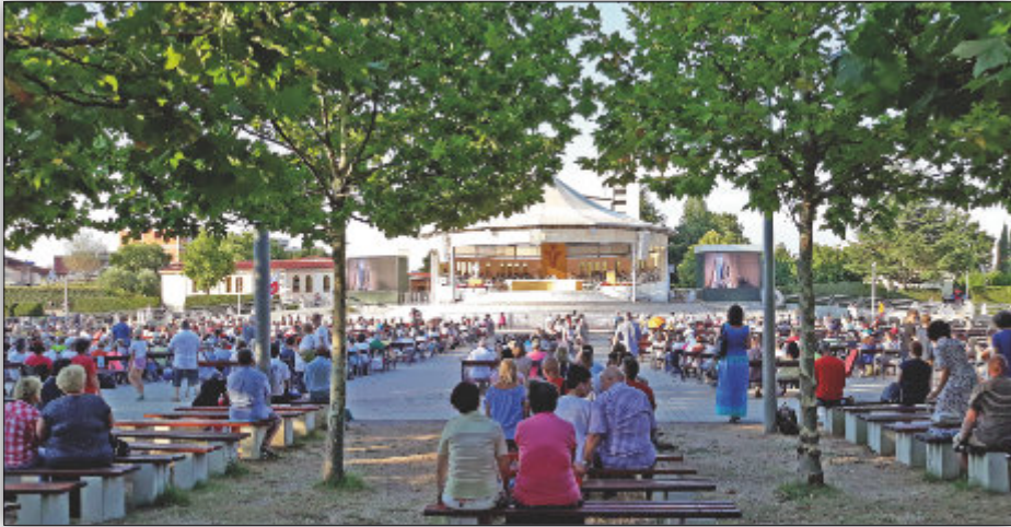
Pilgrims near the St. James church in Medjugorie.