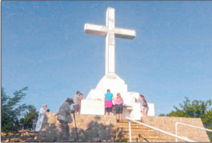
Cross Mountain in Medjugorie