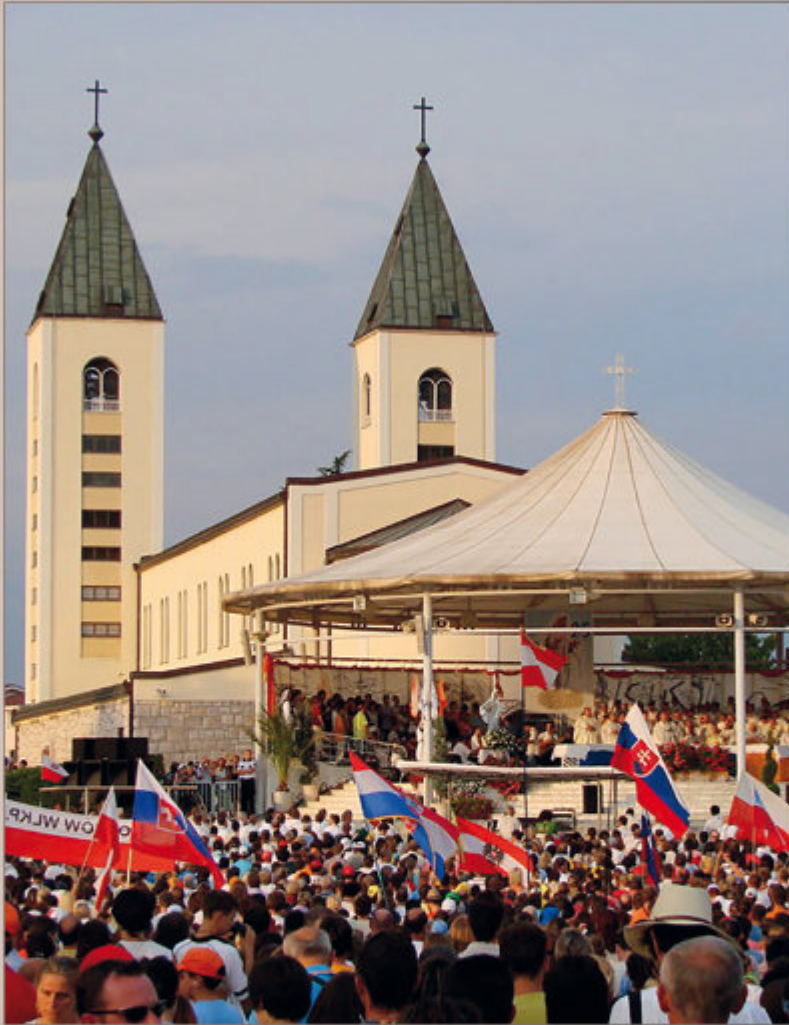
Medjugorje, church Saint James

"It is one of the most lively places of worships and conversions in Europe with healthy spirituality"