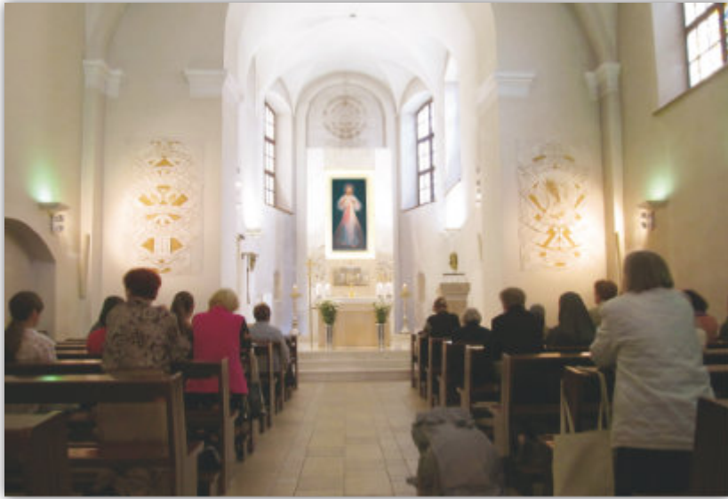
Perpetual adoration at the Sanctuary of Divine Mercy in Vilnius, 12 Dominion St., where the first painting with the image of the Merciful Jesus is displayed.

By means of this Image I shall be granting many graces to souls; so, let every soul have access to it.