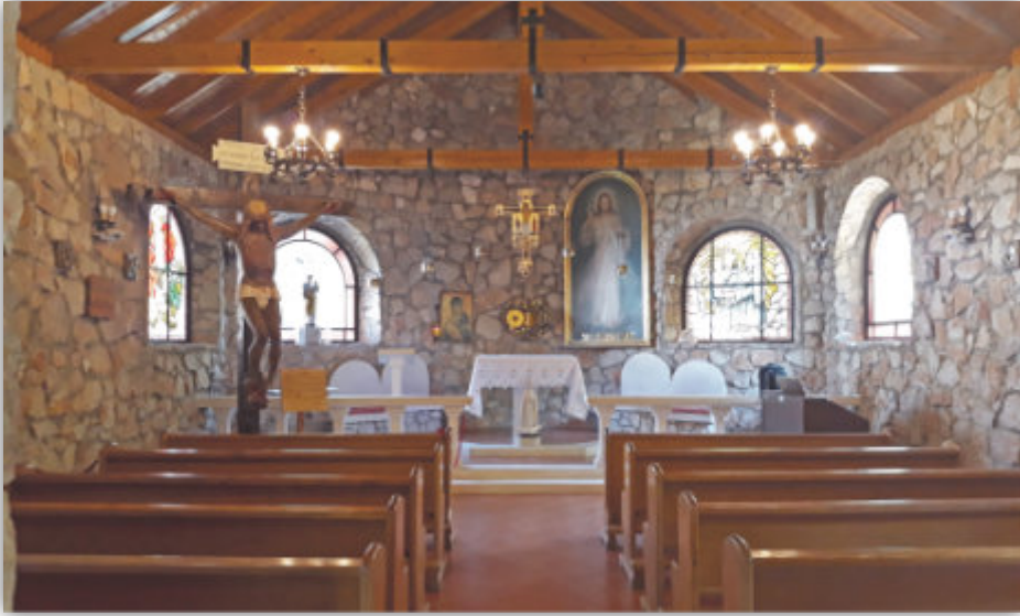
Chapel in the "Oasis of Peace"

Two days later, with the feeling of relief and joy, I went to the "Blue Cross" to thank God for everything that happened. Being alone, I could pray and quietly analyze the entire course of the rousing events with regard to the image. I was happy about the successful completion of the task, having no idea that it was just the beginning my long-term service.