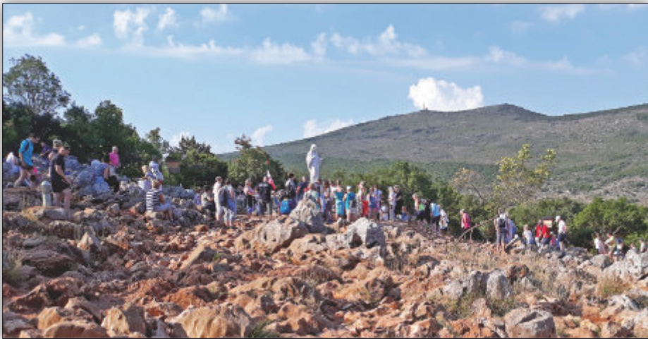
Pilgrims at the “Apparition Hill” in Medjugorie.

The power of work of Divine Mercy in Medjugorie has been revealed through the atmosphere of the omnipresent prayer at church and beyond it. It has been proven by the lines to the confessionals and the prayers of pilgrims continuously arriving from every corner of the world, praying on the hills and desiring to experience